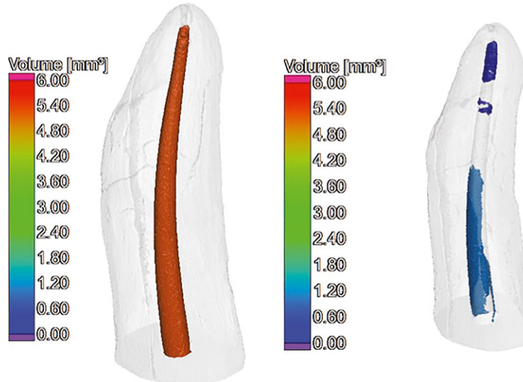
Figure 1 Three-dimensional model of a tooth (coloured according to the volume of material under investigation) after filling and retreatment procedure with Reciproc Blue.