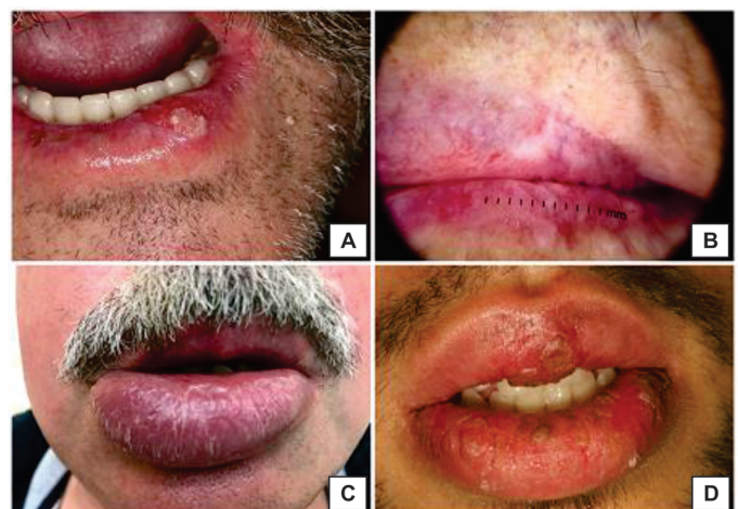
Figure 2 | Mainly irreversible types of cheilitis (A = actinic cheilitis; B = dermoscopic finding of actinic cheilitis; C = granulomatous cheilitis; D = glandular cheilitis).

This is a group of four chronic cheilitis types for which diagnoses are usually based on a biopsy and histology (Fig. 2) (1).