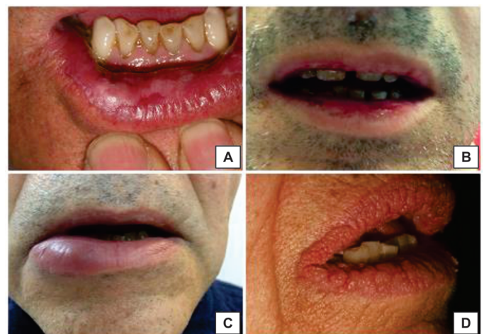
Figure 3 | Cheilitis types connected to dermatoses and systemic diseases (A = lichen planus; B = pemphigus; C = angioedema; D = acanthosis nigricans).

It is necessary to be aware that inflammatory lesions on the lip may occur with many dermatological or systemic diseases. Thus, practitioners may want to consider and check for diseases such as LE, lichen planus, Sjögren syndrome, pemphigus and pemphigoid, and angioedema (Fig. 3). In addition, cutaneous or systemic diseases sometimes begin on oral mucosa involving the lips, and so an adequate examination of all parts of the oral mucosa and skin is necessary for appropriate management.