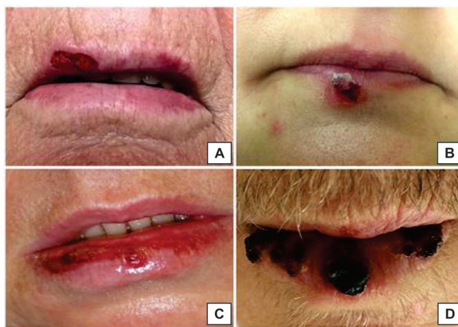
Figure 1 | Mainly reversible types of cheilitis (A = cheilitis simplex; B = infective (herpetic) cheilitis; C = contact/eczematous cheilitis; D = drug-related cheilitis).

Angular/infective cheilitis usually appears in the corners of the lips, commonly as a two-sided inflammation with erythema, deep fissures, or laceration of the labial commissure, possibly with shallow ulcers or crusts (16–18). There are numerous related and