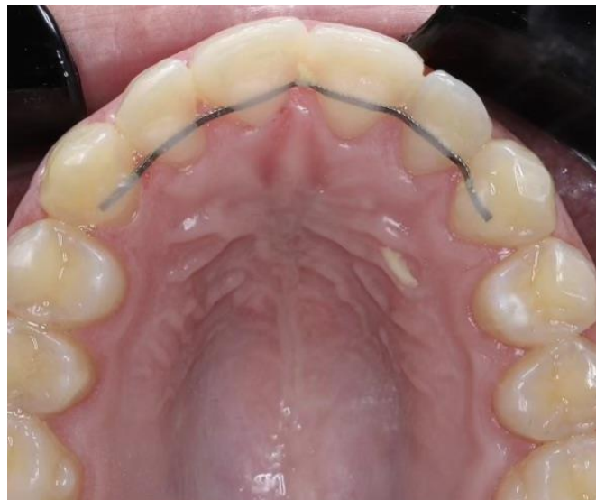
Picture 1. Fixed retention on the palatal side of the maxillary anterior region.

metal wire is cut to the corresponding length. Forming a dry working field can be carried out by a rubber dam or cotton rolls with the help of cheek retractors. The process of composite bonding starts with applying phosphoric acid for at least thirty seconds and rinsing it thoroughly with water. Once the surface is dry, a layer of the bonding agent is applied, dried and polymerized. The next step is to bond the wire to the tooth surface with a composite material. In this step it is crucial to press the wire firmly to the surface to ensure a stable connection between the two. While bonding, it is advised to apply composite to each tooth individually and light cure each area for about thirty to sixty seconds. This way the procedure is more precise. The wire can be pressed against the tooth surface by a soft flexible wire or dental floss which are tied interdentally from the opposite side. After the procedure is complete, it is important to check the occlusion and remove any excess material. Polishing as a final step provides a smooth finish and more comfort for the patient.