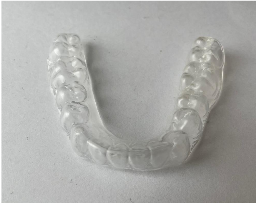
Picture 3. Mandibular invisible thermoplastic/vacuum-formed (Essix) retainer.