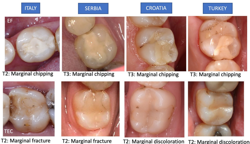
Fig. 4 Marginal chippings and their occurrence years in EQUIA Forte (EF) restorations observed in every country (upper row). Marginal fractures and discolorations observed in Tetric EvoCeram (TEC) restorations in different time periods in every country (lower row)

differences, the study compared independent samples for the two materials and likely had higher inter-patient variability. It is also possible that the difference between the materials was increased by using chlorhexidine as a disinfectant before the placement of restorative materials. The residual chlorhexidine might have interacted with phosphate in dentin due to the cationic part of the chlorhexidine molecule, which binds to negatively charged phosphate in dentin and, therefore, may have potentially impaired the bonding ability of GIC-based materials to tooth structures [35].