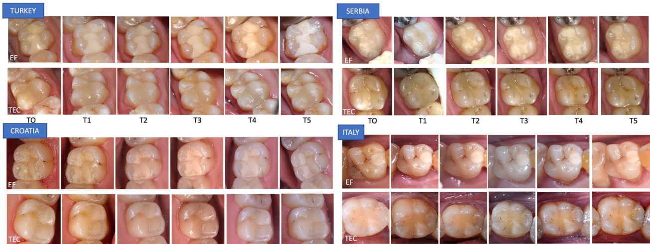
Fig. 1 Two-surface restorations performed in different countries with EQUIA Forte (EF; upper rows) and Tetric EvoCeram (TEC; lower rows) and scored as excellent during the yearly recall periods (T0 to T5)

The differences between evaluators were resolved through consensus. Each restoration was documented by photographs taken from direct, occlusal, buccal and oral directions, as well as before and after restoration and at each follow-up recall.