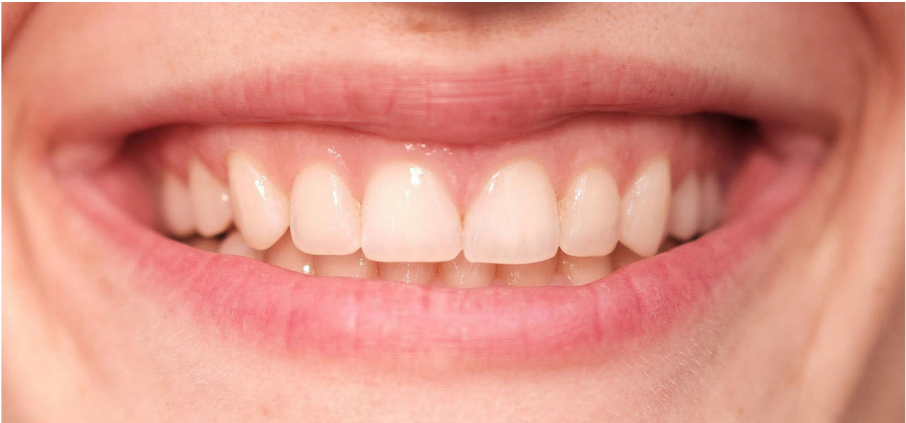
Fig. 1 Reference photograph

Sackingen, Germany). The tip of the measuring probe was placed in the center of the middle third of the right maxillary central incisor. Measured CIE (Commission Internationale de l'Éclairage) L^* a^* b^* values ( L =brightness, achromatic axis; a =chromatic axis red-green; b =chromatic axis yellow-blue) were recorded: L=84.8 , a=-2.2 , b=14.6 .