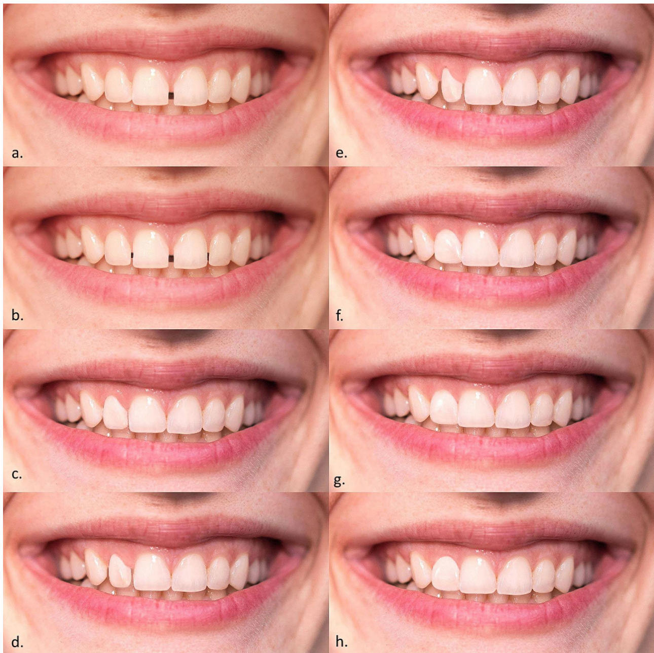
Fig. 4 Position changes: (a) central diastema; (b) multiple diastemas (c) typical rotation of right maxillary lateral incisors + 10°; (d) typical rotation of right maxillary lateral incisors + 20°; (e) typical rotation of right maxillary lateral incisors + 30°; (f) atypical rotation of right maxillary lateral incisors – 10°; (g) atypical rotation of right maxillary lateral incisors – 20°; (h) atypical rotation of right maxillary lateral incisors – 30°

awareness of esthetic dentistry topics increased with academic progression.