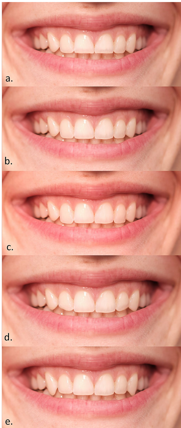
Fig. 3 Length changes: (a) Shortened maxillary central incisors; (b) Elongated maxillary lateral incisors to the length of central incisors; (c) Elongated incisal edges of maxillary lateral incisors to the length of canines; (d) Beveled maxillary lateral incisors' distal edge; (e) Elongation of both canines beyond the length of maxillary second incisors

for the central diastema. The only significant difference between gender was that female students scored lighter tooth shade modifications with lower scores than males. Students who had experience in assisting or had a dentist in close family, mostly gave a bit lower score to the MPs than those who did not assist or had not a dentist in the family. However, without any statistical significance. Moreover, when only preclinical students were selected, t-test also showed no significant differences ( p > .05 ) between those who assisted or had a dentist in the immediate family and those who did not. Combined interaction of gender and of being a clinical or preclinical student showed significant effect only for two-dimension modifications, such as elongated incisal edges of both lateral maxillary incisors beyond incisal edges of central incisors ( F=4.2, p < .05 ) and for shortened incisal edges of both maxillary incisors ( F=4.1, p < .05 ). Combined interaction of assisting and of being a clinical or preclinical student showed no significant effects, while combined interaction of gender and assisting showed significant effects ( p < .05 ) only for some single tooth shade change (right maxillary incisor's lighter shade at 4700 K, darker shade at 5900 and 6300 K).