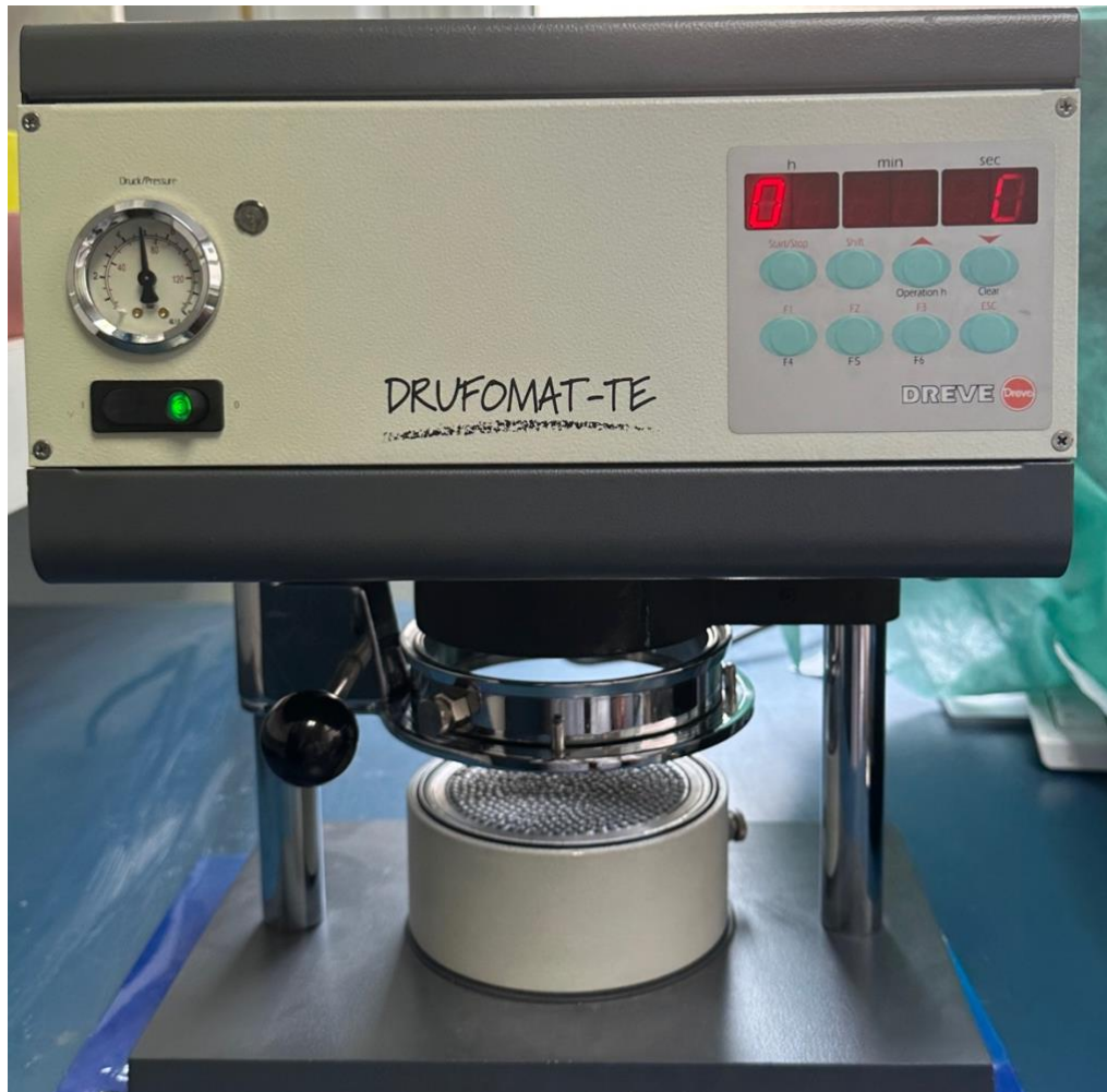
Figure 3. Dreve Druformat-Te mouthguard manufacturing device