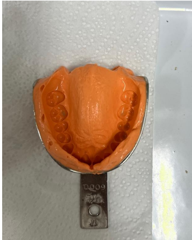
Figure 1. Alginate impression of maxillary teeth and soft tissue