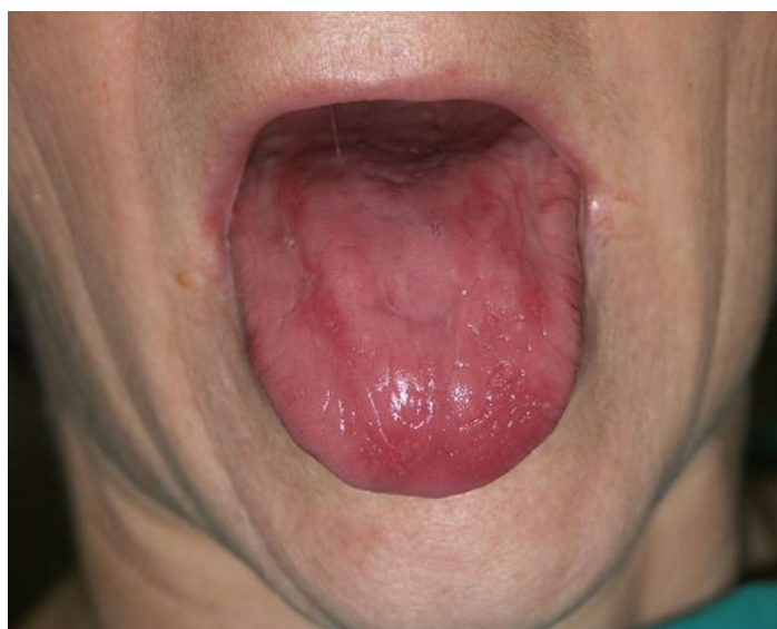
Figure 8. Exfoliative (Moeller Hunter) glossitis. Inflammation and complete loss of filiform papillae of the dorsal tongue mucosa in patients with pernicious anemia due to vitamin B12 deficiency.