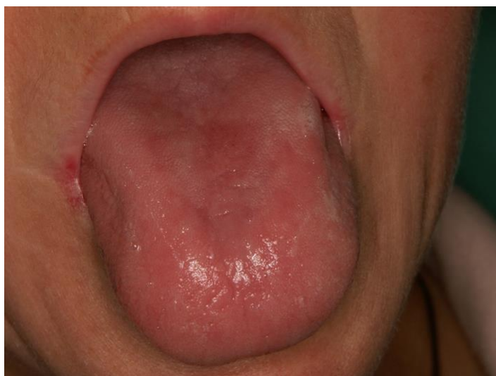
Figure 7. Exfoliative glossitis and angular cheilitis due to hypovitaminosis of B2 and B6 vitamins. Inflammatory changes in the tongue mucosa are usually accompanied by a burning symptom, which is particularly pronounced in vitamin B1 deficiency (Courtesy of Prof. Dr. Marinka Mravak-Stipetić).

Biotin (vitamin H or B7) serves as a vital coenzyme for the metabolism of fats, carbohydrates, and amino acids, supporting cellular proliferation and the health of hair and nails [21,93]. Despite its abundance in egg yolk, offal, yeast, mushrooms, bananas, and peanuts, deficiency can occur from consuming raw egg whites, which inhibit biotin absorption, or from prolonged antibiotic use [36,91,94]. Biotin deficiency symptoms include dermatitis, hair loss, anemia, depressive symptoms, vomiting, and nail inflammation [18]. In children, it may lead to conjunctivitis, ataxia, developmental delays, muscle weakness, paralysis, and vision issues [18]. Oral candidiasis, caused by Candida albicans , is a notable symptom, presenting as white patches within the oral cavity that can hinder swallowing [27]. To counteract biotin and other vitamin deficiencies, the market provides mixed vitamin and mineral supplements, particularly beneficial for selective eaters, ensuring up to 100% of daily nutritional needs when consumed in appropriate volumes [95]. Folic acid (vitamin B9) is imperative in the diets of pregnant women for DNA synthesis and fetal development, with deficiencies previously observed in infants consuming goat's milk. Nowadays, breastfeeding and fortified formulas have significantly reduced this