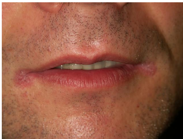
Figure 6. Angular cheilitis due to hypovitaminosis of B2 vitamin (Courtesy of Prof. Dr. Marinka Mravak-Stipetić).

While deficiencies in B-group vitamins are uncommon in children due to their broad availability in the diet, deficiencies can impact the immune, cardiovascular, and nervous systems. Thiamin (vitamin B1) is essential for energy production, nerve impulse transmission, and the maintenance of the myelin sheath. Severe deficiency can lead to diseases such as beriberi and Wernicke–Korsakoff syndrome, especially in individuals with high rice consumption, chronic alcoholism, or those suffering from malnutrition and malabsorption syndromes [65,78,79]. Riboflavin (vitamin B2) is key for energy metabolism and is found in high concentrations in yeast extract, organ meats, wheat bran, milk products, eggs, and meat. It is notably sensitive to light, with its degradation accelerated by the presence of sodium bicarbonate during cooking [36]. Oral health can be significantly affected by deficiencies in vitamins B1 and B2, leading to conditions such as recurrent aphthous stomatitis (RAS), glossitis, and angular cheilitis (Figure 6).