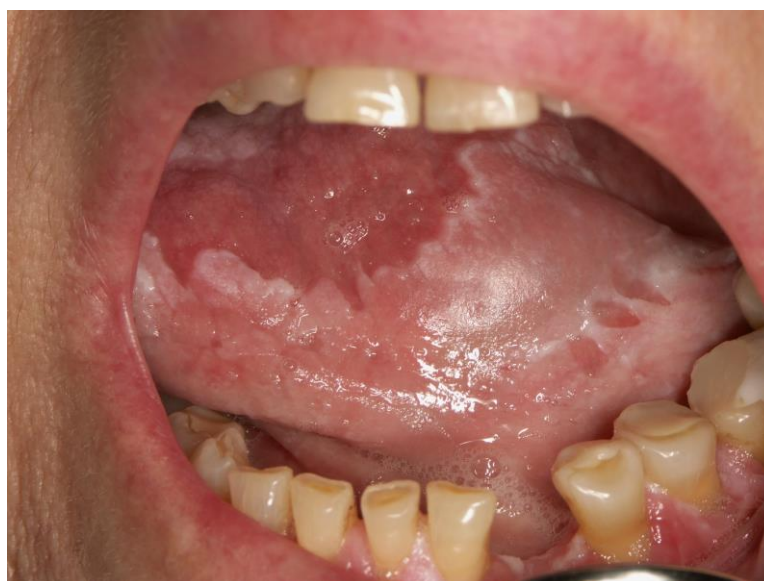
Figure 2. A white keratotic lesion extended along the sublingual mucosa and the lateral edge and ventral part of the tongue, which can also be seen as individual foci on the gingiva. The peculiarity of these white lesions is that they cannot be scraped off. Hypovitaminosis A is a common cause of oral keratotic changes and disorders of mucosal keratinization.

Vitamin A deficiency (VAD) is predominantly observed in infants and preschool-aged children, attributed to low retinol stores at birth and increased nutritional needs during rapid growth periods. VAD is linked to significant child and maternal mortality in developing regions, affecting approximately 1–2.5 million individuals annually [22,23]. Children suffering from VAD may exhibit symptoms like night blindness, keratomalacia, xerophthalmia, Bitot spots, and follicular hyperkeratosis, along with increased susceptibility to infections and nail fragility [18]. Oral complications from VAD include oral keratotic changes and disorders of mucosal keratinization, as well as enamel and dentin anomalies, leading to an increased risk of dental caries, enamel hypoplasia, and periodontitis (Figure 2).