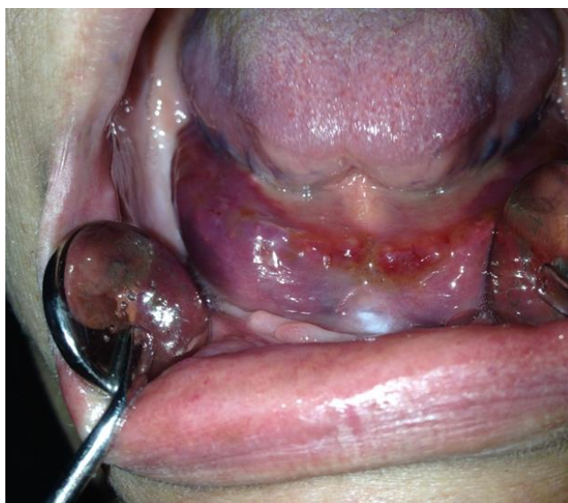
Figure 5. Submucosal bleeding manifesting as a sublingual hematoma in patients with a blood coagulation disorder due to vitamin K deficiency.

a robust skeletal system in children, underscoring the broad utility and significance of vitamin K in human nutrition and health [28].