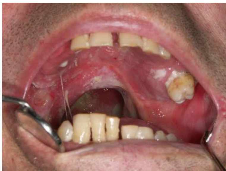
Figure 4. Mucositis and xerostomia in a patient undergoing radiotherapy after surgery of oropharyngeal cancer. Ulcerated and inflamed areas of the oral mucosa can be seen along with thick mucous saliva and white plaque deposits on the mucosa due to lack of serous saliva and washing of mucosa.