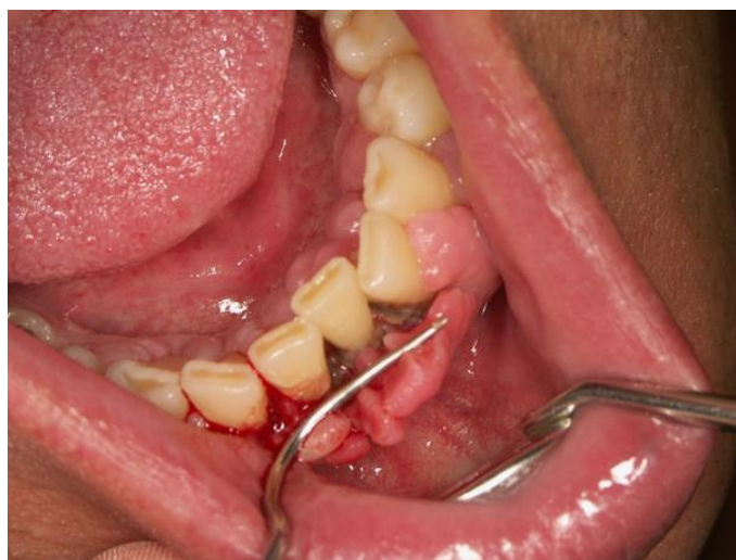
Figure 9. Hyperplastic gingivitis and periodontitis. Inflammation and hypertrophy of gums with bleeding and deep periodontal pockets as a result of hypovitaminosis C (Courtesy of Prof. Dr. Marinka Mravak-Stipetić).

associated with periodontal diseases, a response to bacterial toxins causing mucosal damage in gingivitis and periodontitis [65,107,125].