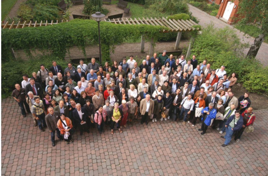
Greifswald conference photo