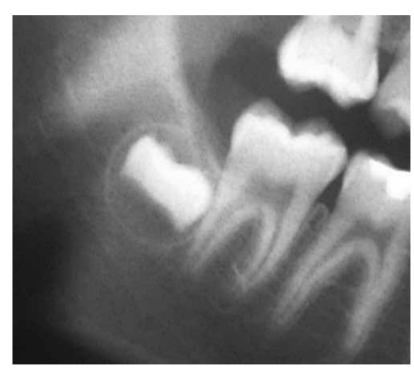
Fig. 1. Mandibular third molar in Stage A. The crown is completely formed within the dental follicle but the root has not yet begun to develop. The occlusal plane is covered with alveolar bone.

Eruptive phases were classified in 4 stages, from A to D^{25} . Stage A: Occlusal plane covered with alveolar bone (Figure 1). Stage B: Alveolar emergence; complete re-