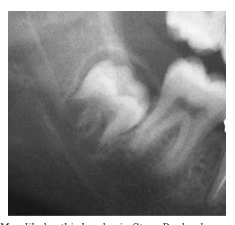
Fig. 2. Mandibular third molar in Stage B, alveolar emergence. The roots have started to develop and there is complete resorption of alveolar bone over occlusal plane.

Difference in chronology of third molar eruption between males and females was tested using t-test. Spear-