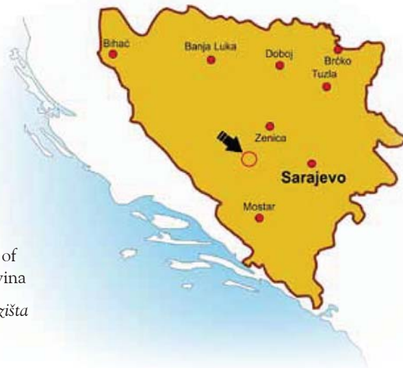
Figure 1 - The site location on the map of Bosnia and Herzegovina

An archaeological site with a stone wall and ceramic fragments, located on the hill above the source of Krušnica river, has been dated to older Iron Age (Marijan, 1988). During field recognition, pieces of ceramic were