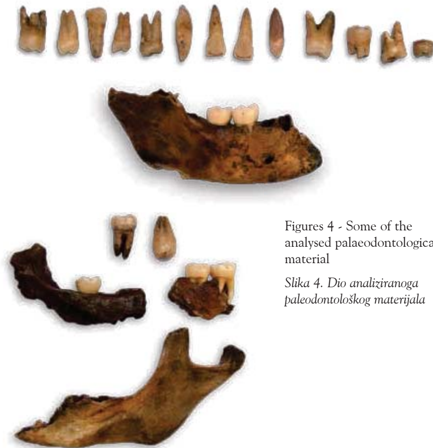
Figures 4 - Some of the analysed palaeodentological material