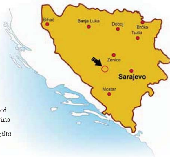
Figure 1 - The site location on the map of Bosnia and Herzegovina

An archaeological site with a stone wall and ceramic fragments, located on the hill above the source of Krušnica river, has been dated to older Iron Age (Marijan, 1988). During field recognition, pieces of ceramic were