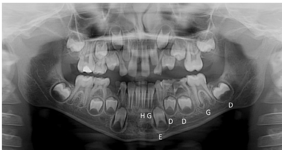
Fig. 1. A sample of Demirjian's developmental stages on the first seven left mandibular teeth.