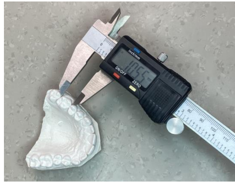
Figure 1. Manual measurement of the plaster models obtained from an alginate impression using a Mitutoyo digital caliper.

The measurements of the digital models were performed using Ortho Analyzer software (version 1.5.1.7, 3Shape, Copenhagen, Denmark) and through manual measurements on the plaster models obtained from an alginate impression using a Mitutoyo digital caliper (Mississauga, ON, Canada) (Figures 1 and 2).