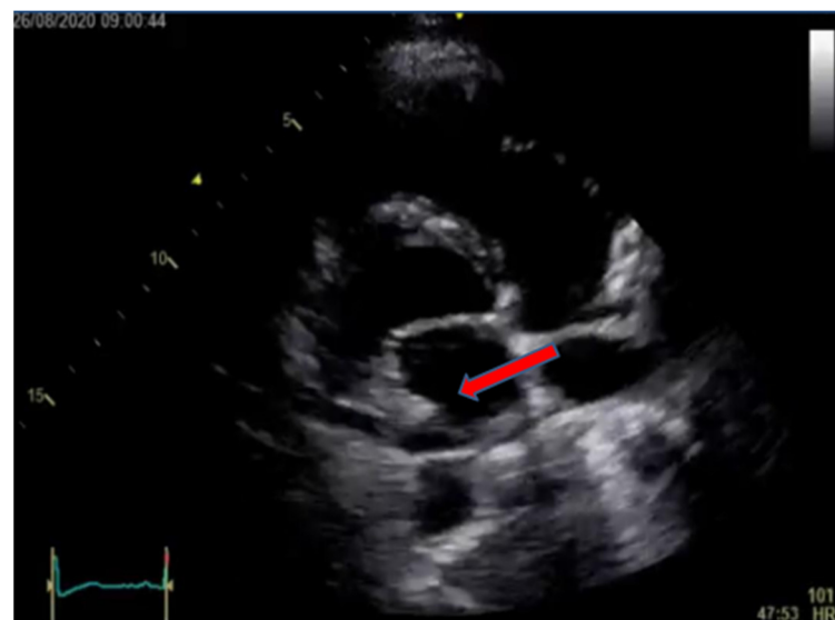
Figure 1. Transesophageal echocardiogram (TEE) showing large tricuspid vegetation on mid-esophageal four-chamber view (arrow showing tricuspid vegetation).

As the diagnosis of probable endocarditis was established, transthoracic echocardiography (TEE) was performed and showed no vegetation on any of the heart valves. Consequently, an indication for transesophageal ultrasonography was established, and the result of this examination showed a floating vegetation, sized 3 × 11 mm, on the anterior leaflet of the tricuspid valve with significant tricuspid regurgitation (3+). There were no signs of vegetation in the mitral, aortic, or pulmonary valve (Figure 1).