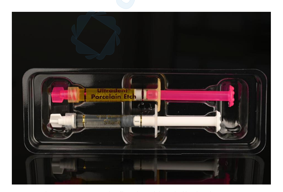
Figure 4. 10% Hydrofluoric acid and silanization agent

The connection between the restoration and the composite cement is enabled by the chemical bond formed through the silicon dioxide particles found in glass ceramics. The application of silane treatment to ceramics results in increased surface wetting, leading to enhanced bonding properties (20). For this bond to occur, a binding molecule such as organic silane must be present. The ceramic is silanized, which creates a promoting action of bonding between the inorganic material of the ceramic and organic polymers in the composite cements (8). Silane formulations that come in single-bottle form are already pre-hydrolyzed, and due to their shorter shelf-life, they tend to lose their effectiveness over time, such as Monobond Etch&Prime (Ivoclar Vivadent) (18). Therefore, double-bottle solutions are the preferred choice, such as Bis-Silane (BISCO) (21). Silanes that come in two-component form single consist of acetate acid in the first component and non-hydrolyzed silanes in the second component. The acid from the first component activates the silanes in the second component. These components need to be mixed right before the application. To prepare the ceramics, multiple layers of silane are applied, and each layer must be dried for the solvents to evaporate before the next layer is added. After silanization, an adhesive resin is applied to the restoration and properly dried and polymerised with blue light.