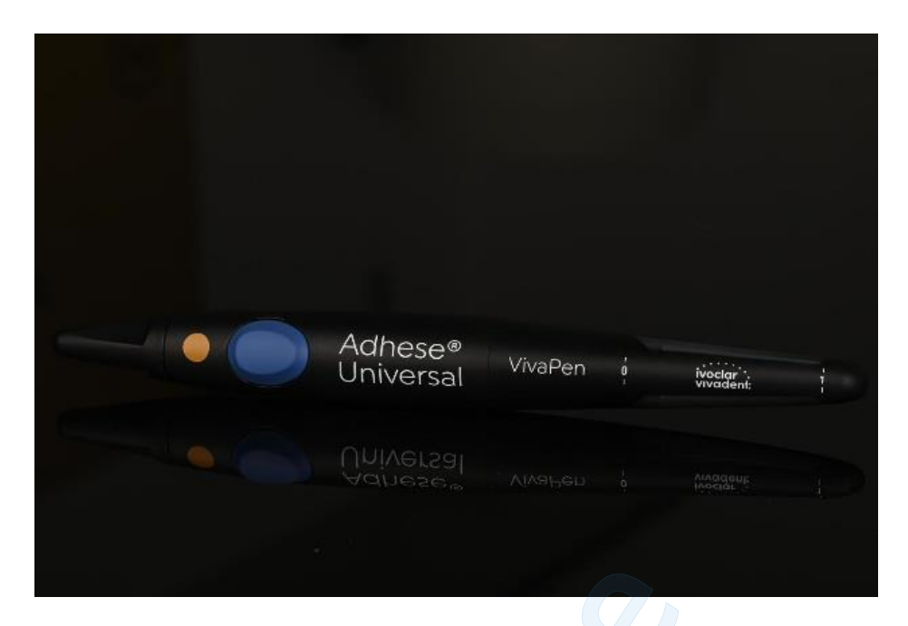
Figure 6. Adhese Universal , single-component, light-cured adhesive for direct and indirect bonding procedures and all etching protocols