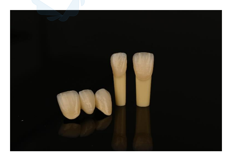
Figure 3. Ceramic restorations in forms of three - unit oxide ceramic bridge and lithium disilicate veneers

Bonding to silica-based dental ceramics using etching techniques and silanization is well-established, but no particular method is generally accepted for the bonding of dental oxide ceramics with little or no silica (15). Although conventionally cemented, there are cases where these ceramics may benefit from adhesive cementation. Research suggests that utilizing air abrasion in conjunction with the application of tribochemical silica or aluminium oxide, followed by the use of adhesive agents, can enhance the bond strength of resin cements (16). Sandblasting is carried out with particles of aluminium oxide (Al2O3) size 30 – 50 μm under pressure, or with synthetic diamond particles. Also, the surface of the restoration can be treated by the application of ceramic primers containing phosphate monomers 10-MDP (10-methacryloyloxydecyl dihydrogen phosphate) that chemically bonds with metal oxides in ceramics, for example Clearfil Ceramic Primer or Alloy primer (Kuraray Dental, Okayama, Japan). After applying this type of primer, it is recommended to apply dual curing or chemically curing composite cements with the same monomer composition, as well as primer (e.g. PanaviaF 2.0 (Kuraray Dental, Okayama, Japan) (17).