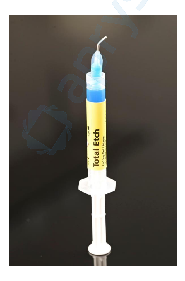
Figure 5. Total Etch, 37% ortophosphoric acid

modern clinical practice, two-phase systems are commonly utilized wherein after the etching, the primer and the bond are applied and rubbed onto the demineralized surface of both the enamel and the dentin for 20 seconds, dried off appropriately and polymerised for 10 seconds (18). When opting for self-etching systems in tooth preparation, modern practice leans towards all-in-one systems, although a two-step system may also be used. In this method, an acidic monomer is applied to both enamel and dentin via a single bottle adhesive. The adhesive is allowed to sit for a duration of 5-10 seconds and subsequently blown out with air, with no water rinse. Examples of such systems include All-Bond SE from Bisco in Schamburgh, Illinois, OptiBond XTR from Kerr in Orange, CA, USA, and GC G-Bond from GC Corporation in Tokyo, Japan. The literature suggests that only the enamel should be selectively etched, while the dentin is etched with the acid present in the adhesive. It is recommended to pair a suitable adhesive system with a compatible composite material (24).