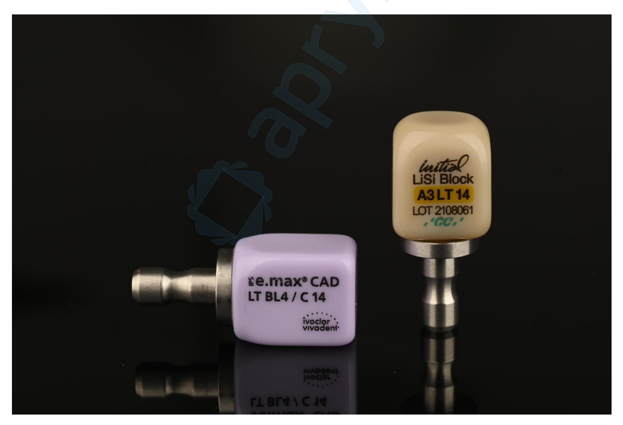
Figure 2. IPS e.max Press/CAD and Initial LiSi ceramic blocks

The most common aesthetic material in prosthetic dentistry is glass ceramics, which is produced by regulating the crystallization of glass. There are several types of glass ceramics, such as hydroxyapatite, fluorapatite, and lithium disilicate glass ceramics. The key benefit of this type of ceramics are its enhanced physical characteristics, resulting in a flexural strength increase of 250 – 350 MPa, while maintaining exceptional optical properties. As a result, it is recommended to be used in a variety of dental applications, including veneers, inlays, onlays, overlays, single crowns, and even short-span bridges, with the second premolar serving as the final abutment. Lithium disilicate glass ceramics are composed primarily of prismatic lithium disilicate (Li2Si2O5), which makes up approximately 65% of the material by volume (14). Ceramic ingots are available for heat-press production technique, while ceramic blocks can be used for CAD/CAM machining. Some examples of this ceramic system include: IPS e.max Press/CAD (Ivoclar Vivadent Liechtenstein), CEREC Tessera, (Dentsply, York, PA, USA), VITA AMBRIA Press (VITA Zahnfabrik, Bad Säckingen, Germany).