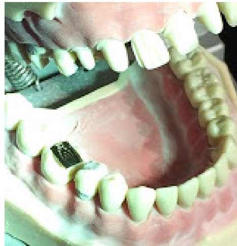
Figure 2. Miniaturized visual Snellen chart placed in the tooth cavity of a dental phantom.

The participants were examined in a working zone lit by a 60 W surgery lamp parallel to the participants' visual axis, sitting in a dental chair with a maximum head deflection of 25° forward in an upright position. Their feet were fully placed on the floor, their knees were placed below and their elbows level with the dental phantom. The examination room was illuminated by sunlight and artificial light ranging from 250 to 500 lux, measured using a luxmeter. The miniature visual chart was fixed in the dental phantom's molar cavity (Figure 2). The visual acuity was registered by decimal graduation between 0.1 to 1.0 as the smallest optotype of the miniaturized Snellen optotype that an examinee managed to read at a working distance without correction (VSC), by application of x1.5 head magnifying glasses (VNL), using Galileo's x2,5/350 mm binocular magnifying devices (VGA2,5), Kepler x3,3/450 mm optical magnification system (VKP3,3) and a x4,5/350 mm optical system (VKP4,5) (Figure 3). The study was approved under No. 05-PA-26-6/2015 by the Ethics Committees of the School of Dental Medicine, University of Zagreb.