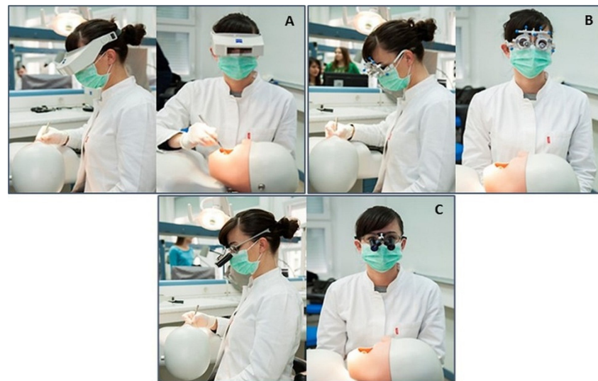
Figure 3. Examining the dentistry visual acuity under simulated clinical conditions by applying (A) head magnifying glasses, (B) a Galilean telescope, (C) and a Keplerian telescope.