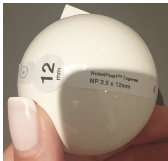
Figure 1. NobelPearl Zirconia Material in Raw Form for Dental Implant Fabrication

An alternative viable material that has emerged and is used particularly for the aesthetic zone is Zirconium implants. Zirconium is a ceramic material that demonstrates biocompatibility, high strength, and a natural white colour that imitates the appearance of natural teeth (Figure 1). Research suggests that zirconium implants show exceptional osseointegration and comparable success rates in comparison to titanium implants (12). Furthermore, the favourable interaction of zirconium with soft tissues assists with the prevention of peri-implantitis and other inflammatory conditions thereby further enhancing its suitability for aesthetic purposes (13).