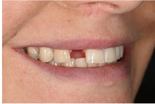
Figure 2. Pre-treatment photograph showing the aesthetic zone prior to implant placement

a zirconia abutment and crown. This case illustrates the importance of custom-made treatment planning and materials selection that deliver both strength and aesthetic compatibility with the natural teeth of the patient. The overall smile aesthetics and facial harmony of the patient were drastically improved, thereby positively influencing the patient's confidence and social interactions.