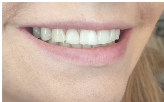
Figure 3. Post-treatment photograph demonstrating the enhanced aesthetic outcome after implant placement