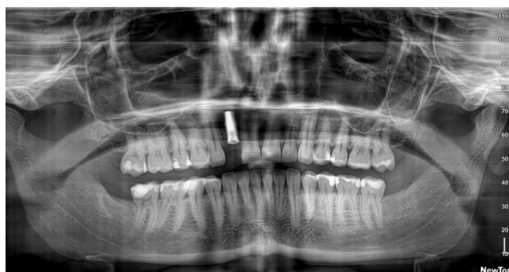
Figure 5. Orthopantomogram (OPG) showing the implant's osseointegration and position in the upper lateral incisor post-treatment

The OPG (Figure 5) delivers a comprehensive assessment of the post-surgical implant placement, exemplifying prosperous osseointegration and proper alignment within the upper lateral incisor region. The precise angulation and depth of the implant, as displayed in the OPG, are crucial for both functional and aesthetic success. This imaging approves the accuracy of the surgical technique, which comprised of careful planning to guarantee the implant was positioned optimally relative to adjacent teeth. Furthermore, this radiographic evidence supports the choice to use a zirconia abutment, which improves the aesthetic result by reducing appearance of metal, a common problem with titanium abutments within the aesthetic zone.