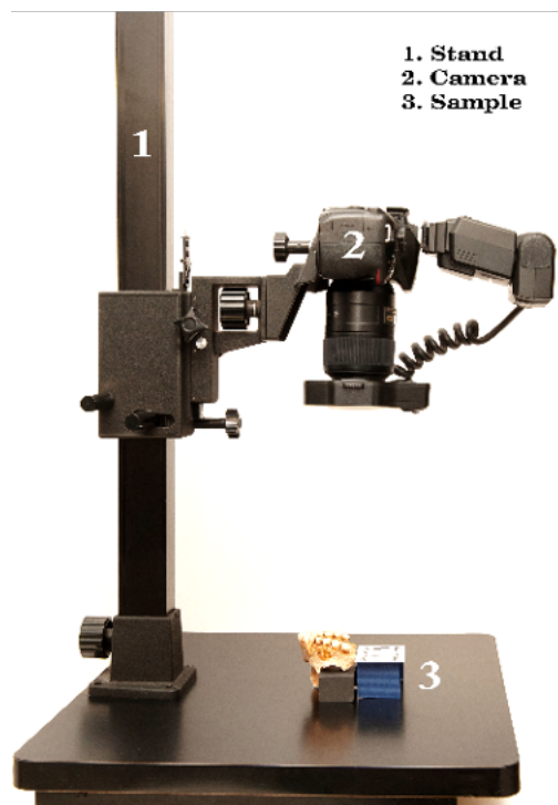
Figure 1. Schematic representation of the recording of occlusal surfaces of skeletal remains in this research

during the archaeological excavation process. Since this study aimed to analyze tooth wear, teeth affected with severe carious lesions were also excluded, which brings the total number of excluded teeth to 1563 of all teeth from all maxillary and mandibular remains. Regarding the historical periods, the LA period had 739 lost and 26 caries-affected teeth, while the EMA period had 748 lost and 40 caries-affected teeth. The study included 4408 teeth, of which 1545 molars, 1224 premolars, 647 canines, and 992 incisors.