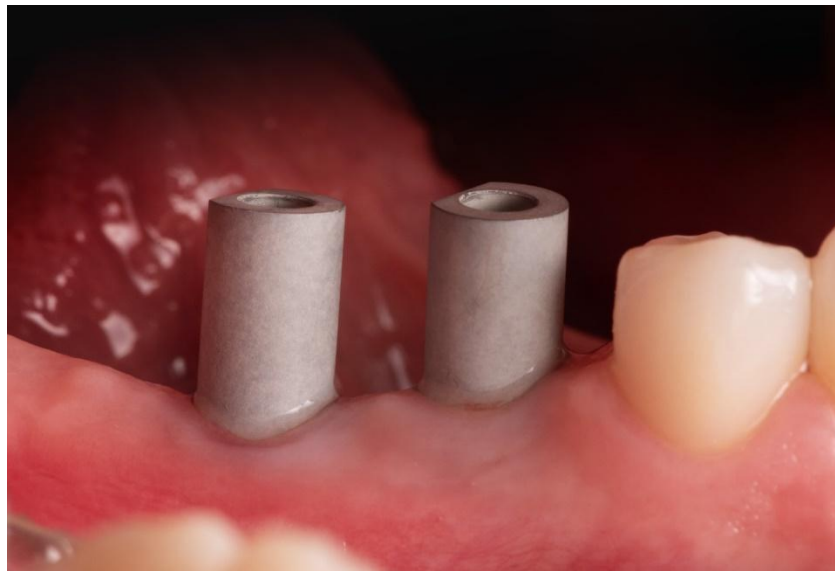
Picture 4. Intraoral scan body

of the working cast, and a laboratory scanner produces a standard triangulation language (STL) file. This data allows the precise transfer of the implant's position, depth, and angulation into the design software. Intraoral scan bodies (ISBs) are typically made from metal alloys, polymer materials like PEEK, or a combination of both (hybrid ISBs). They vary in geometrical features, design, size, and surface properties. An ISB generally comprises three regions: the base (most apical area), the body (middle region), and the scan region (upper part). Compared to laboratory scan bodies, intraoral scan bodies are smaller to fit the oral cavity and are hand-torqued onto the implant. Some scan bodies feature a retaining screw or a press-fit fixation (17,18).