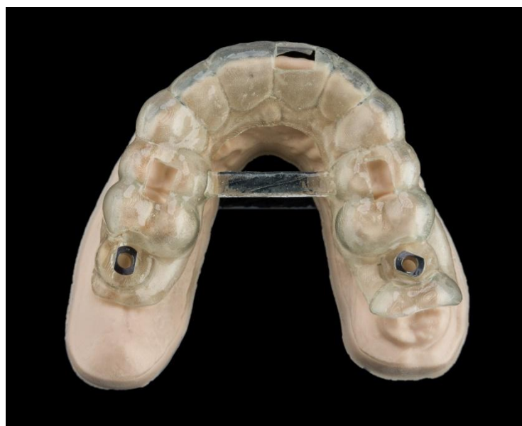
Picture 3. Surgical guide