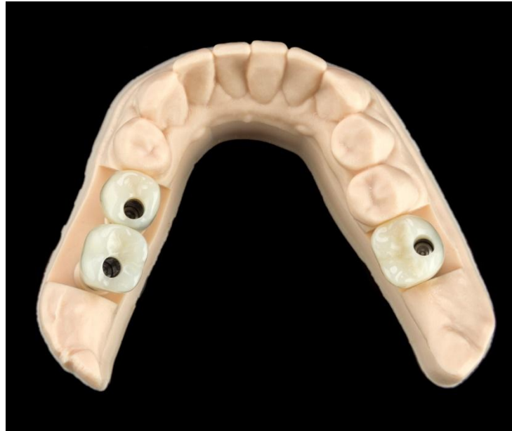
Picture 5. Dental implant crown