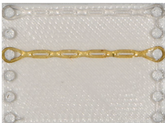
Fig. 2. The most noticeable color change observed in Forestadent short chains after immersion in the coffee solution.

agents (Ahmadizenouz et al., 2016), which may account for the slight increase in the + b* values observed in the current study (Al-Dharrab, 2013). Similar to Red Bull, beer yielded relatively low \Delta E^* values, placing it among the solutions with minimal color change. These results align with existing literature (Chami et al., 2022; Sarembe et al., 2022). Coconut water, like beer, exhibited minimal staining. It can be inferred that the primary cause of discoloration is a reduction in lightness. Specifically, the decrease in the L* value accounted for 97 % of the overall color alteration.