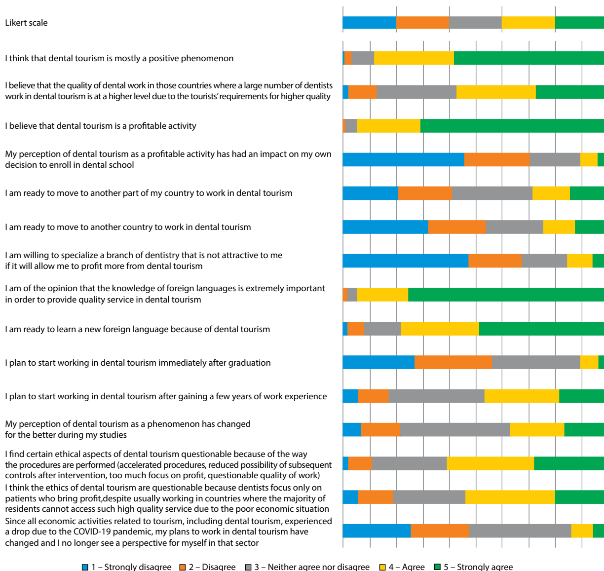
FIGURE 3. Answers to Likert scale questions by percentage

dentists from countries that are receptive markets for dental tourism from existing literature, who similarly described dental tourism as an activity that encourages them to invest in high-end equipment, education, and better quality of work [7, 16, 17]. This indicates that a positive perception of dental tourism is not necessarily conditioned with direct involvement in this activity, but can also arise from living in a country where dental tourism takes place, especially if there is a perspective for oneself to engage in this activity. However, such attitudes are in almost complete contradiction with the literature that analyzed the opinions of dentists and physicians from countries that are emittive markets for dental and medical tourism, who questioned the quality of work, materials and expertise of staff which took part in dental and medical tourism [4, 6, 18-20].