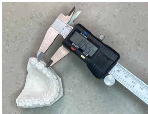
Figure 1. Manual measurement of the plaster models obtained from an alginate impression using a Mitutoyo digital caliper.

The measurements of the digital models were performed using Ortho Analyzer software (version 1.5.1.7, 3Shape, Copenhagen, Denmark) and through manual measurements on the plaster models obtained from an alginate impression using a Mitutoyo digital caliper (Mississauga, ON, Canada) (Figures 1 and 2).