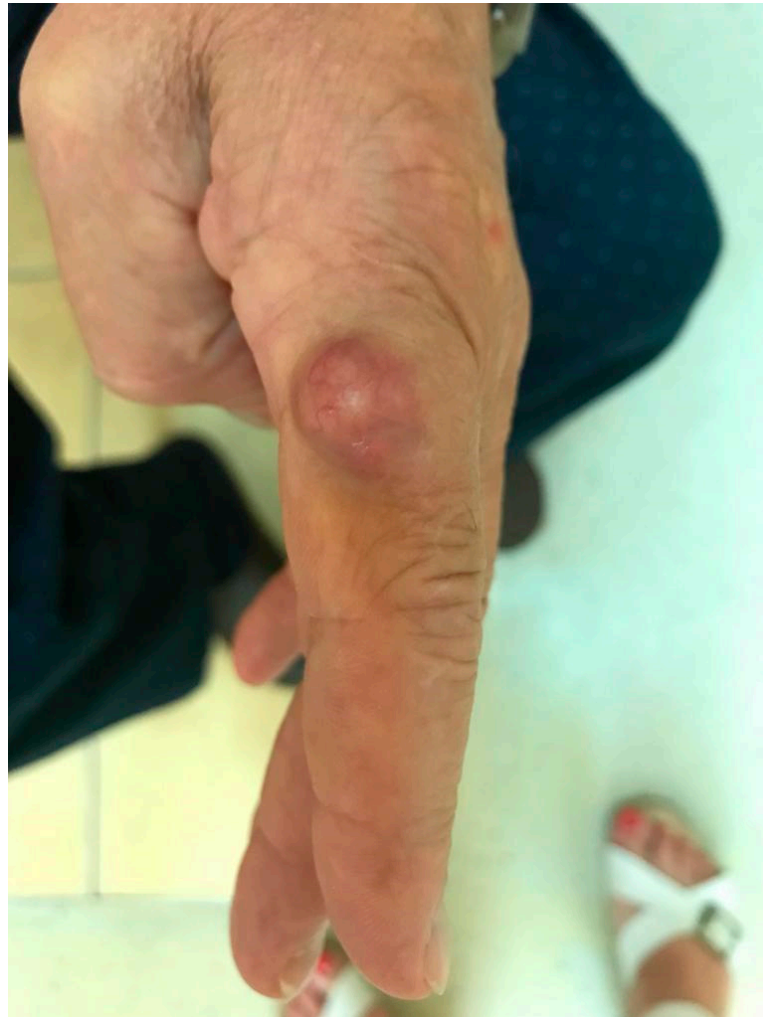
Figure 3. Cutaneous nodule on the left index finger as a manifestation of P. lilacinum infection.

confirmed through a histopathological analysis. That is why it is mandatory to obtain a skin biopsy, since a histological examination with routine stains can detect hyphae and reproductive structures, such as phialides and conidia [40]. Additionally, the Grocott methenamine silver (GMS) stain is commonly used, since it imparts a black color to the fungal profiles and a pale green color to the background [44]. Due to its ability to sporulate in tissues, P. lilacinum can be confused with Blastomyces dermatitidis , but it is differentiated by the presence of hyphal elements within a tissue biopsy, elevated (1-3)- \beta -d-glucan, and growth on cultures [45]. In doubtful cases, it is advisable to confirm the diagnosis with MALDI-TOF mass spectrometry, DNA sequencing, or polymerase chain reaction (PCR) amplification of the 18 S RNA [40]. Identifying the exact fungus is of utmost importance due to the major differences in the sensitivity to antifungal agents within the same species, with an example being Purpureocillium lilacinum vs. P. variotti [41]. Additionally, when a disseminated disease is suspected, imaging techniques should be performed to assess the severity of the disease. The most commonly used imaging techniques are chest and paranasal CT (computed tomography) scans, followed by CNS imaging and the use of both a CT scan and MR [5]. Figure 4 summarizes the clinical presentation, the patient characteristics, and the diagnostic steps in a P. lilacinum infection.