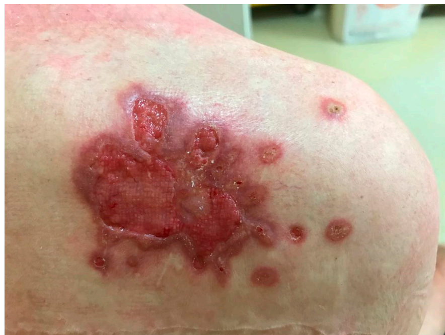
Figure 2. Ulcerative skin lesion on the skin of right scapula as a manifestation of P. lilacinum skin infection (from archives of the authors).