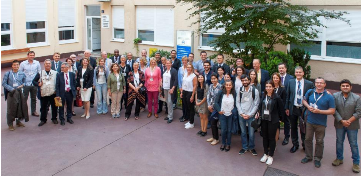
Fig. 1. Participants of the Dental Anthropology Scientific Symposium Zagreb 2016 in the yard of the School of Dental Medicine University of Zagreb.

http://dental-anthropology-symposium.sfzg.hr/