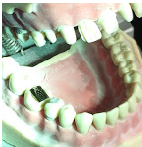
Figure 2. Miniaturized visual Snellen chart placed in the tooth cavity of a dental phantom.

The participants were examined in a working zone lit by a 60 W surgery lamp parallel to the participants' visual axis, sitting in a dental chair with a maximum head deflection of 25° forward in an upright position. Their feet were fully placed on the floor, their knees were placed below and their elbows level with the dental phantom. The examination room was illuminated by sunlight and artificial light ranging from 250 to 500 lux, measured using a luxmeter. The miniature visual chart was fixed in the dental phantom's molar cavity (Figure 2). The visual acuity was registered by decimal graduation between 0.1 to 1.0 as the smallest optotype of the miniaturized Snellen optotype that an examinee managed to read at a working distance without correction (VSC), by application of x1.5 head magnifying glasses (VNL), using Galileo's x2,5/350 mm binocular magnifying devices (VGA2,5), Kepler x3,3/450 mm optical magnification system (VKP3,3) and a x4,5/350 mm optical system (VKP4,5) (Figure 3). The study was approved under No. 05-PA-26-6/2015 by the Ethics Committees of the School of Dental Medicine, University of Zagreb.