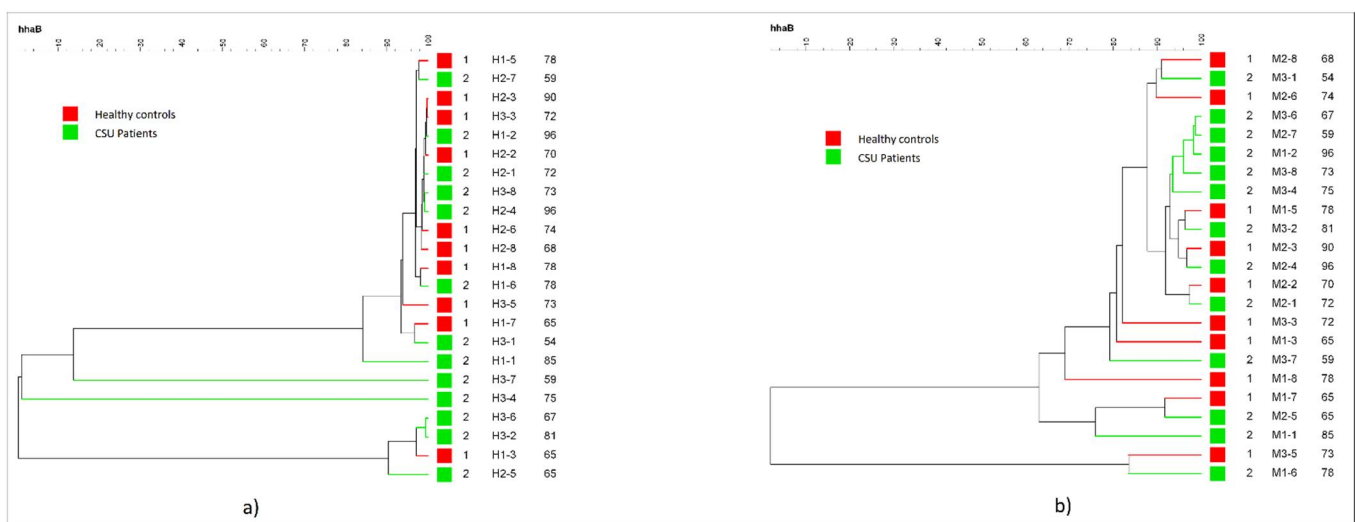
Figure 2. Dendrogram of the salivary microbiota profiles of Chronic Spontaneous Urticaria (CSU) patients and HC. (a) HhaI -digestion. (b) MspI -digestion.

Dendrogram constructed by using a minimal variance algorithm did not reveal any major cluster characteristic for either group in neither HhaI nor MspI digested T-RF patterns (shown in Figure 2a,b). This study found no correlation between the severity of urticaria (evaluated by the UAS score) and microbial diversity. The post-hoc analysis did not identify any statistically significant difference in OTU abundance between the CSU and HC groups. The dominant phylum in the CSU group (according to the HhaI and MspI -digested T-RF patterns) was Proteobacteria, while Firmicutes were more abundant in the HC group. There was no significant difference at the phylum level in Firmicutes, Bacteroidetes, and Proteobacteria between the groups. OTUs representing the genus Fretibacterium were observed only in the control group. OTUs representing the genus Pseudomonas were more abundant in the CSU group. OTUs representing the genera Bacteroides , Haemophilus , Bifidobacterium , Capnocytophaga , Fretibacterium , Porphyromonas were more abundant in the HC group than in the CSU group.