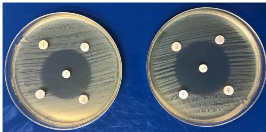
Figure 2. Fluoride-releasing restorative materials and the resin composite inoculated on BHI agar plates: Penicillin G,1U at the middle and 1—Riva Self-Cure, 2—Equia Forte HT Fil, 3—Riva Self-Cure with coating, 4—Equia Forte HT Fil with coating, 5—Zirconomer, 6—G-aenial A’Chord, 7—Riva Silver, 8—Beautifil II.

No inhibition zones were observed in any tested restorative materials. Antibacterial activity was also not detected in any of the restorative materials tested after the application of 0.20% w/w (900 ppm) sodium fluoride. However, a 40 mm inhibition zone was observed with the Penicillin G,1U. (Figure 2).