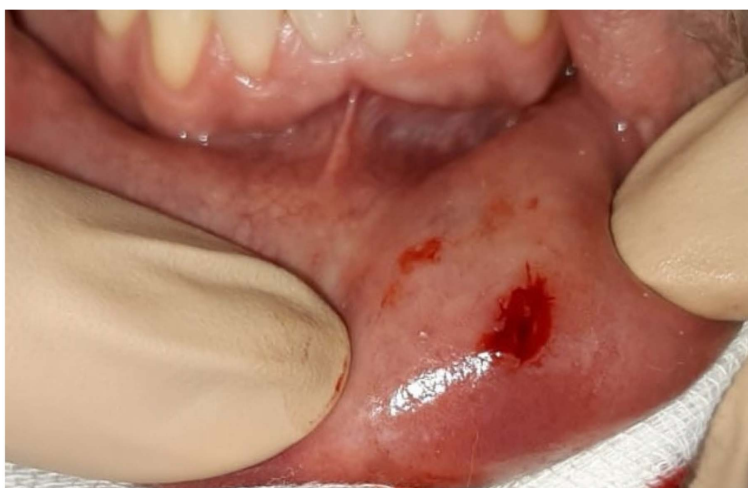
Figure 1. Wound on lower lip after surgical extraction of the parasite.