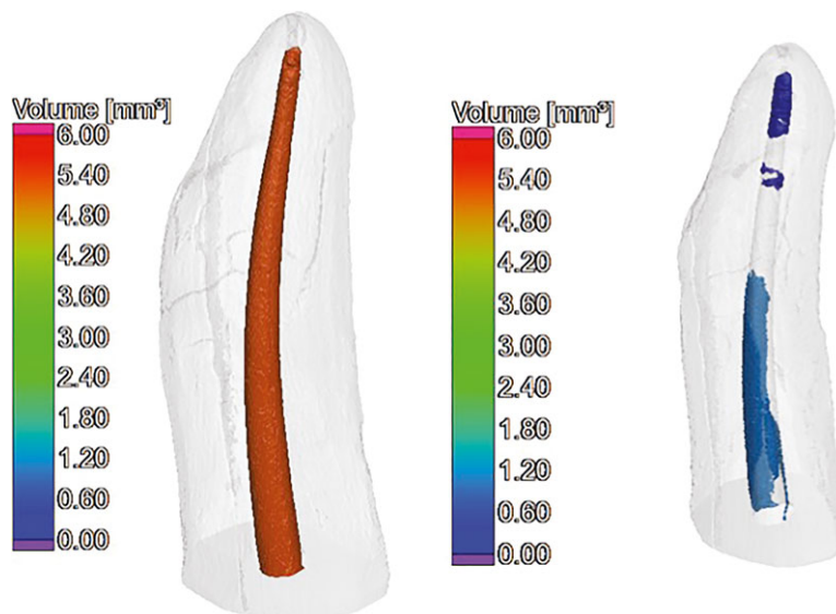
Figure 1 Three-dimensional model of a tooth (coloured according to the volume of material under investigation) after filling and retreatment procedure with Reciproc Blue.