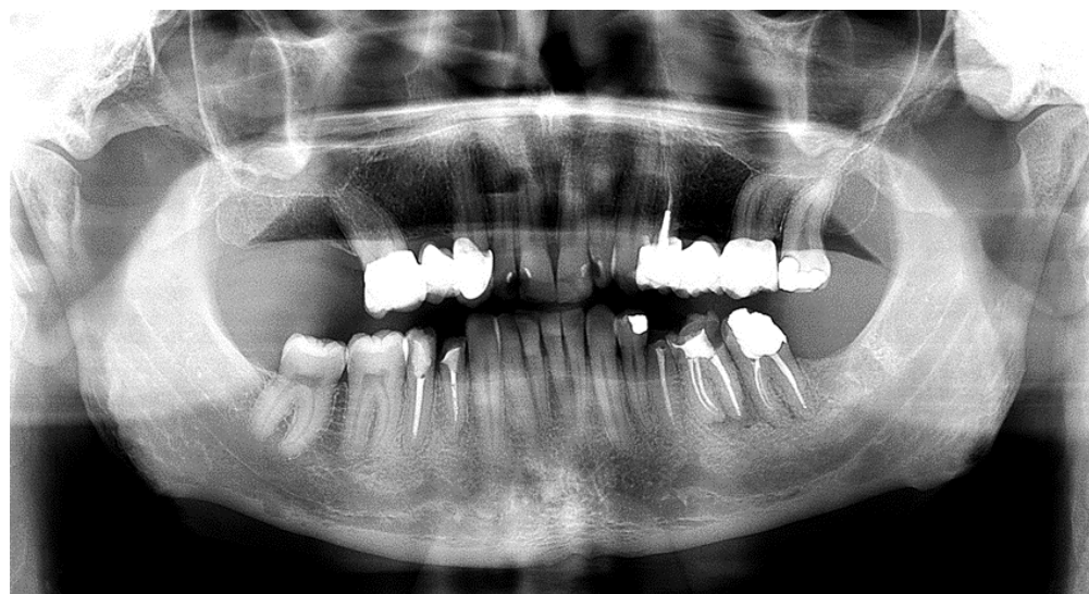
Figure 3. Image shows a decrease in bone mineral density in the mandible, particularly along the mandibular canal and an increase in alveolar porosity due to Vitamin D deficiency (Courtesy of Prof. Dr. Marinka Mravak-Stipetić).

Awareness around Vitamin D deficiency (VDD) has grown significantly due to its widespread occurrence [37], raising concerns particularly in pediatric health, as highlighted by Aguiar et al. [38]. VDD is notably severe in infants, stemming from low levels in both maternal and cow's milk. In older children, deficiencies often result from inadequate dietary choices, with chronic shortages seen in those following vegan diets. The primary consequence of VDD is impaired bone mineralization, manifesting as rickets in young children or osteomalacia in adolescents. Oral impacts of this deficiency include a form of amelogenesis imperfecta during tooth development, alterations in dentin leading to dentogenesis imperfecta, and ectodermal dysplasia. VDD can also trigger decreased bone mineral density, leading to jawbone resorption [15,21] (Figure 3).