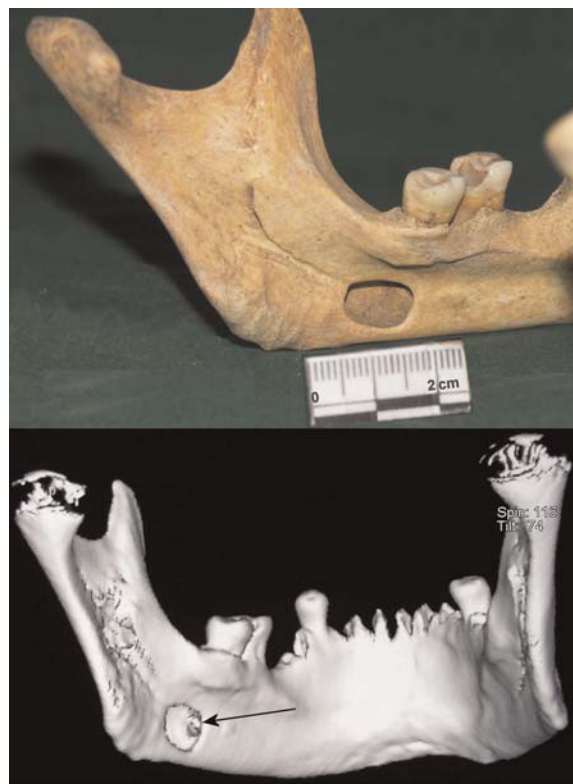
Figure 2. Expression of Stafne's defect on the specimen from Korlat Sv. Jere (grave No. 228) on the left side of the mandible (photograph and three-dimensional CT volume rendering reconstructed image). This figure is available in colour online at wileyonlinelibrary.com .

Lingual mandibular bone depressions (known also as developmental salivary gland defect, Stafne's defect,