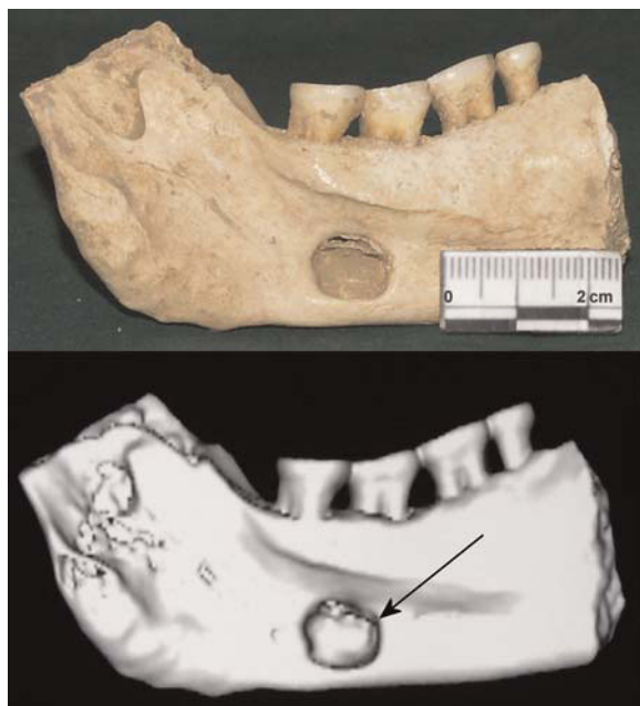
Figure 1. Expression of Stafne's defect on the specimen from Zmajevac (grave No. 79) on the left side of the mandible (photograph and three-dimensional CT volume rendering reconstructed image). This figure is available in colour online at wileyonlinelibrary.com .

8.6 mm in height. This defect is categorised as a deep lesion (6.3 mm). CT showed a well-defined lingual defect in the posterior aspect of the left side of the mandible (Figure 3). The buccal cortex was thinned and slightly expanded, but with no invasive features.