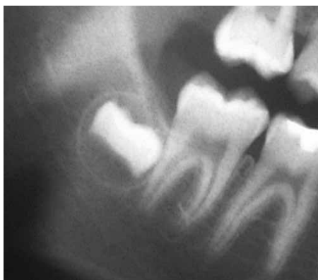
Fig. 1. Mandibular third molar in Stage A. The crown is completely formed within the dental follicle but the root has not yet begun to develop. The occlusal plane is covered with alveolar bone.

Eruptive phases were classified in 4 stages, from A to D 25 . Stage A: Occlusal plane covered with alveolar bone (Figure 1). Stage B: Alveolar emergence; complete re-