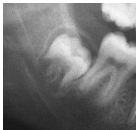
Fig. 2. Mandibular third molar in Stage B, alveolar emergence. The roots have started to develop and there is complete resorption of alveolar bone over occlusal plane.

Difference in chronology of third molar eruption between males and females was tested using t-test. Spear-