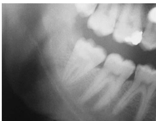
Fig. 4. Mandibular third molar in Stage D, complete emergence in occlusal plane. The roots have completely developed, including closure of the apices, and the tooth has reached the level of the occlusal plane of the adjacent second molar.

man's correlation coefficients were computed to assess correlation between eruptive stages of left and right third molars. Statistical analysis was performed by MedCalc program (MedCalc Inc., F. Schoonjansen, Mariakerke, Belgium).