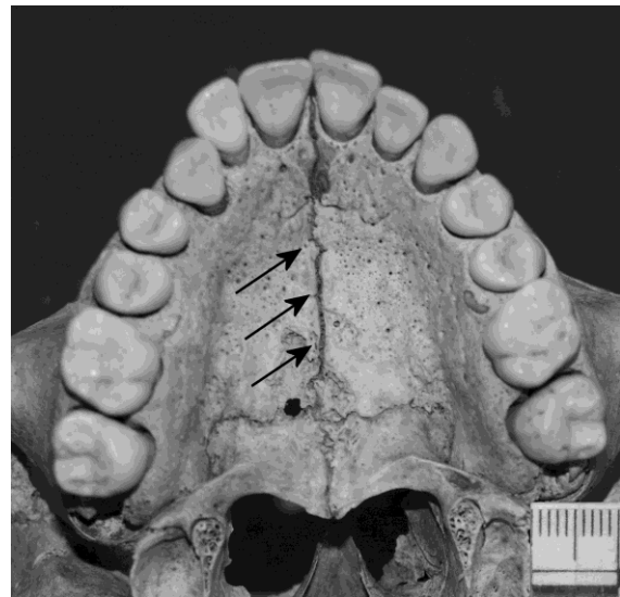
Fig. 2. Open median palatine suture