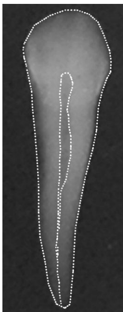
Fig. 3. Age estimation using pulp/tooth area ratio (dotted lines on the radiograph indicate the outlines of upper canine and its pulp)