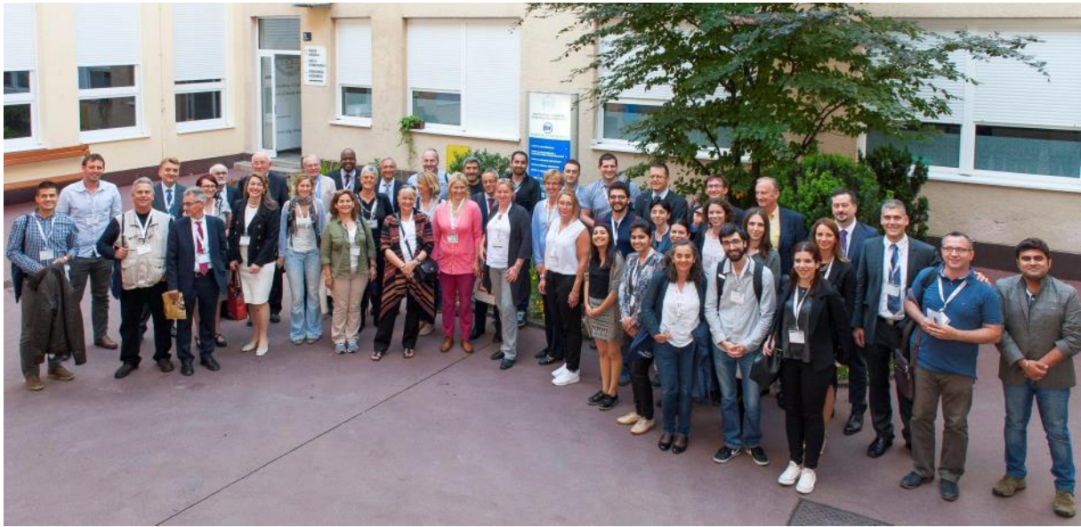
Fig. 1. Participants of the Dental Anthropology Scientific Symposium Zagreb 2016 in the yard of the School of Dental Medicine University of Zagreb.

http://dental-anthropology-symposium.sfzg.hr/