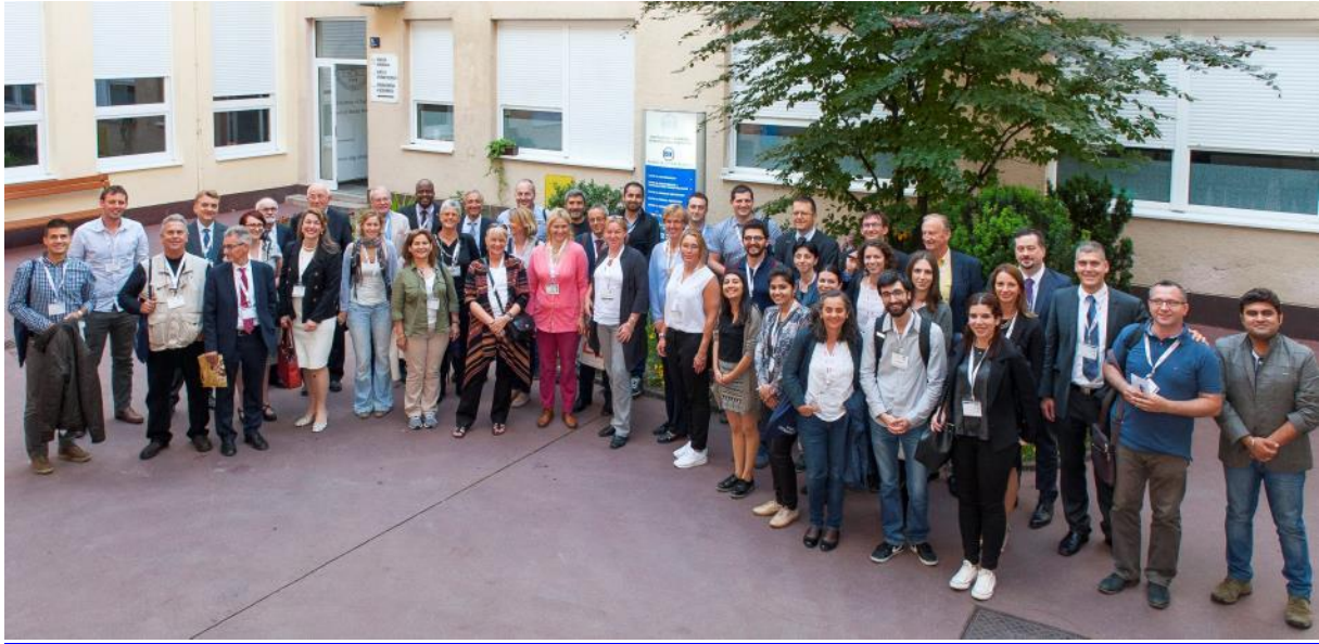
Fig. 1. Participants of the Dental Anthropology Scientific Symposium Zagreb 2016 in the yard of the School of Dental Medicine University of Zagreb.

http://dental-anthropology-symposium.sfzg.hr/