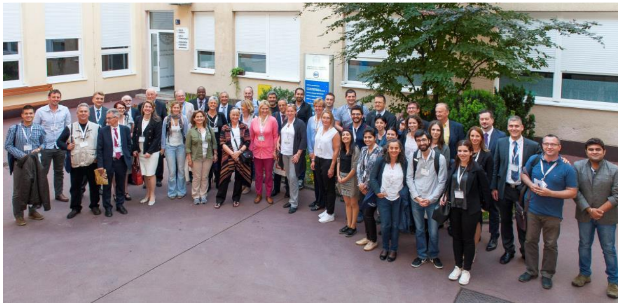
Fig. 1. Participants of the Dental Anthropology Scientific Symposium Zagreb 2016 in the yard of the School of Dental Medicine University of Zagreb.

http://dental-anthropology-symposium.sfzg.hr/