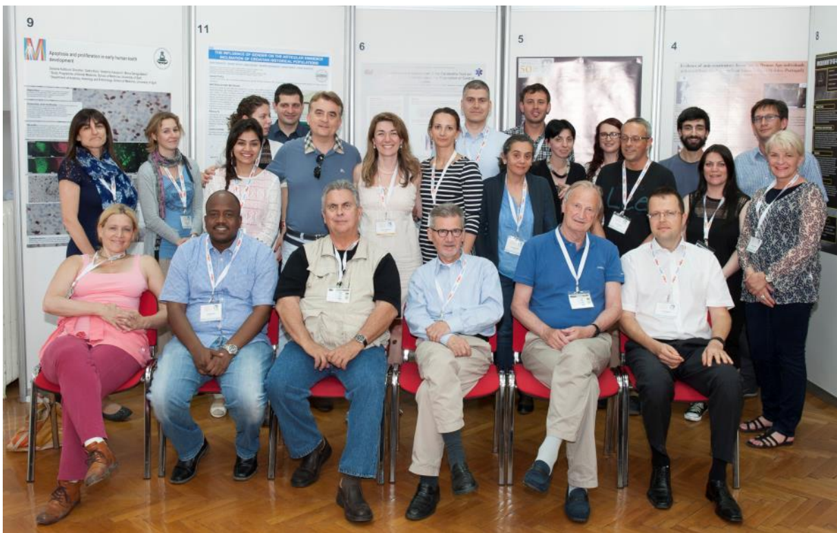
Fig. 2. Participants of the Workshop on the Arizona State University Dental Anthropology System (ASUDAS).