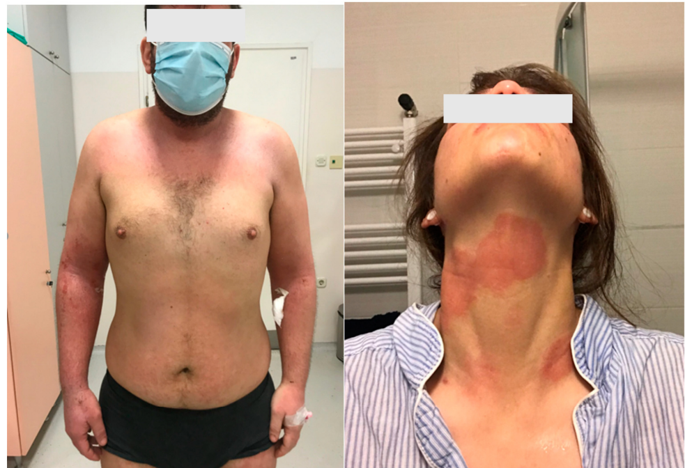
Figure 1. Clinical pictures of the patients with atopic dermatitis.

The prevalence of AD has doubled or tripled over the last 30 years in industrialized countries. It is estimated that 15% to 30% of children, and 2% to 10% of adults, are affected [4–7]. AD typically occurs in the first year of life (in about 60% of cases) but may appear at any age, and its complete remission has been observed in 70% of children before adolescence. Early onset of the disease, familial associations, and early allergen hypersensitivity are all risk factors for a prolonged disease course and persistence into adulthood [8,9].