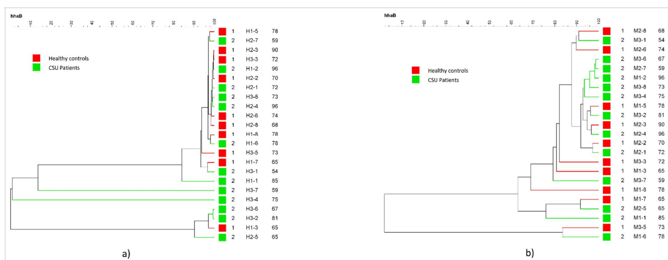
Figure 2. Dendrogram of the salivary microbiota profiles of Chronic Spontaneous Urticaria (CSU) patients and HC. (a) HhaI -digestion. (b) MspI -digestion.

Dendrogram constructed by using a minimal variance algorithm did not reveal any major cluster characteristic for either group in neither HhaI nor MspI digested T-RF patterns (shown in Figure 2a,b). This study found no correlation between the severity of urticaria (evaluated by the UAS score) and microbial diversity. The post-hoc analysis did not identify any statistically significant difference in OTU abundance between the CSU and HC groups. The dominant phylum in the CSU group (according to the HhaI and MspI -digested T-RF patterns) was Proteobacteria, while Firmicutes were more abundant in the HC group. There was no significant difference at the phylum level in Firmicutes, Bacteroidetes, and Proteobacteria between the groups. OTUs representing the genus Fretibacterium were observed only in the control group. OTUs representing the genus Pseudomonas were more abundant in the CSU group. OTUs representing the genera Bacteroides , Haemophilus , Bifidobacterium , Capnocytophaga , Fretibacterium , Porphyromonas were more abundant in the HC group than in the CSU group.